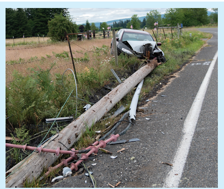
The car sits off to the side of the road along with the telephone pole on Skookumchuck road on July 2.

The Tenino Girls also have a home scrimmage July 14 against W.F. West at 6 p.m.