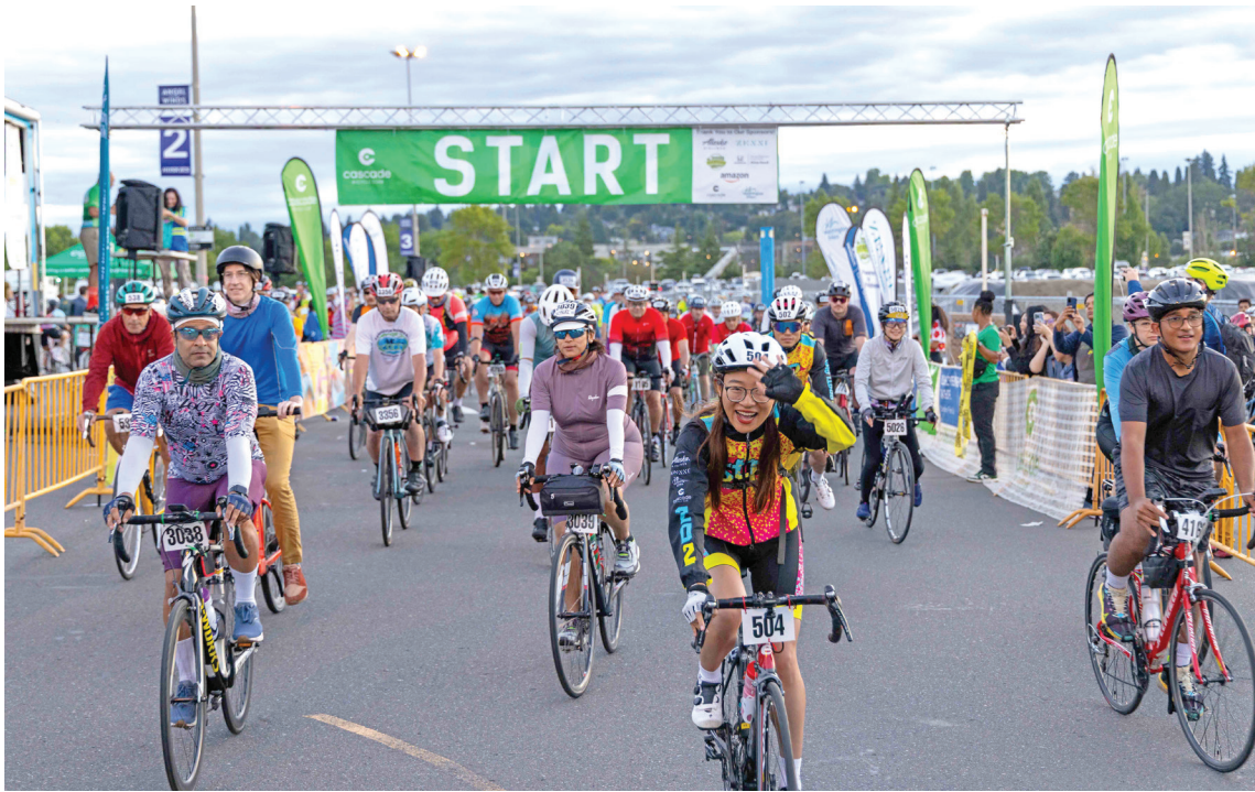
Riders leave the starting line July 12, 2025 at the start of the ride in Seattle, WA.

(USPS 616-400) Vol. 104, No. 27 TENINO, WASHINGTON • $1